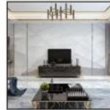
tile background wall