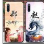
3C products shell