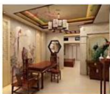
Building materials Industry