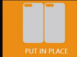
PUT IN PLACE